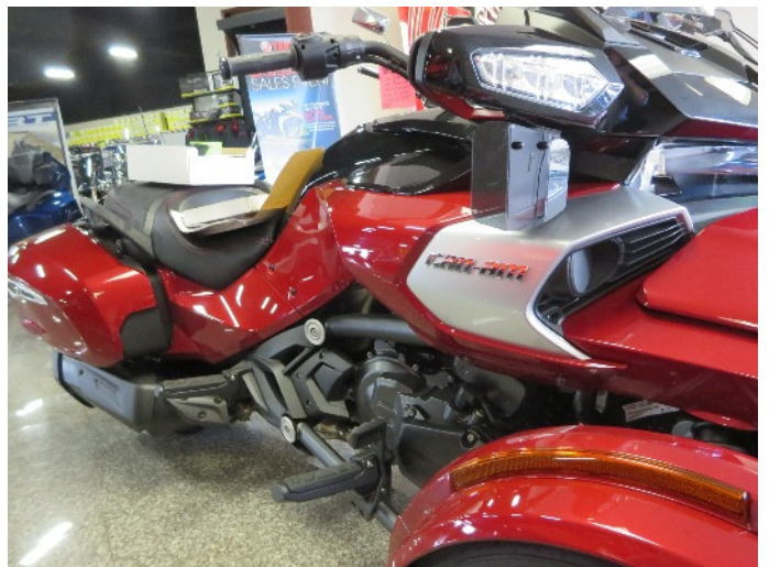
Finished Installed Hand Wing