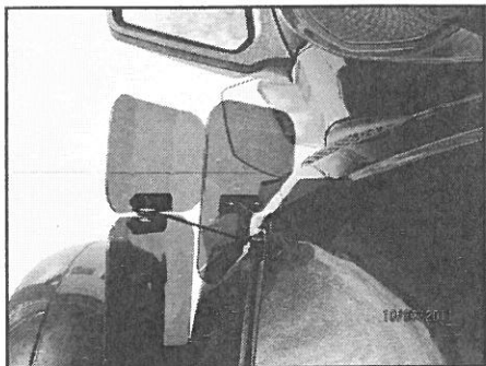
Left Side, Rear View